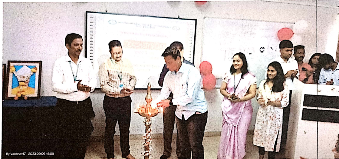
2023/09/06 15:09

Peth Vadgaon Tal. Hatkanangale, Dist. Kolhapur (MH) PIN - 416 112 Web: www.amcoph.org | Phone: 0230-2471360 61 | E mail: copbpharm@gmail.com