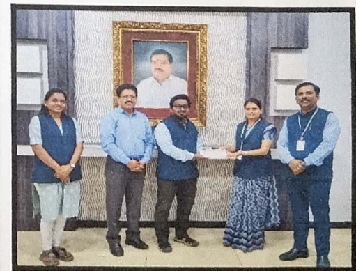
Photographs of Alumni Seminar on “Global Opportunities & Study Abroad for Pharmacy Students: Exploring Education, Career & life beyond border” dated on Thursday, 09/10/2025 at 03:00