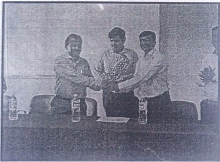
Felicitation of Speakers