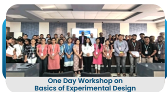
One Day Workshop on Basics of Experimental Design