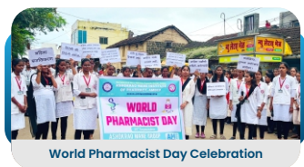
World Pharmacist Day Celebration