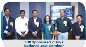
SUK Sponsored 2 Days National Level Seminar