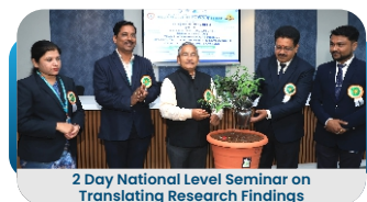
2 Day National Level Seminar on Translating Research Findings