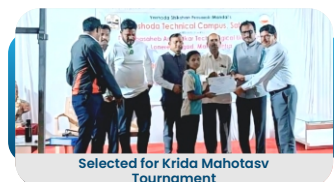
Selected for Krida Mahotsav Tournament