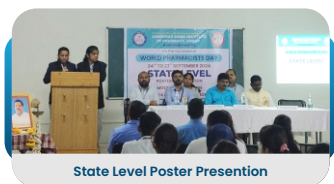
State Level Poster Presentation