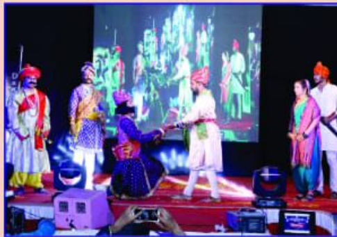
Cultural Event - Spandan 2019 Fashion Show