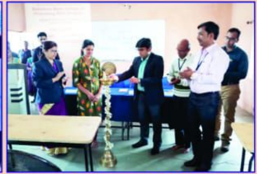
Seminar on PCOS