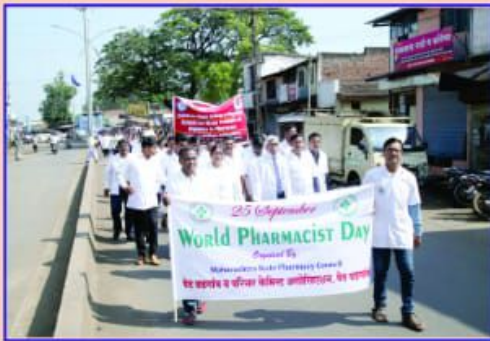
World Pharmacists Day