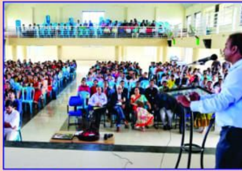
One day Seminar on Importance of Pharmacovigilance