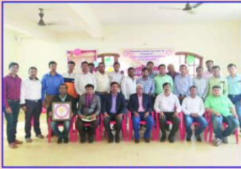
Alumni meet held at Goa