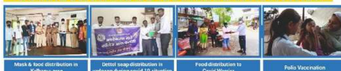
Mask & face distribution in Kolhapur area